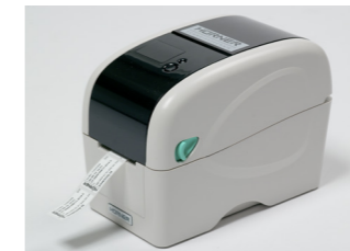
Tag printer and label tags

The HÜRNER movement pushbutton fitted to the basic machine chassis allows moving the machine carriage when the welder stands next to the chassis. This enables convenient welding without constant back-and-forth between the hydraulic and control box and the machine chassis.